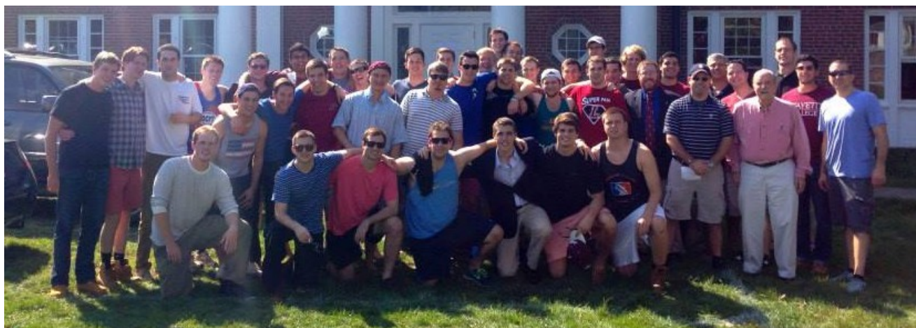
Forty-seven Rho Deke alumni from '13 to '50 attended the 2013 Homecoming game against Bucknell.