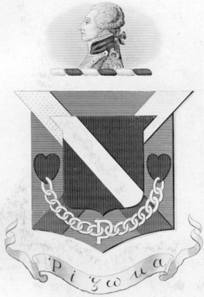
The Rho Chapter Crest